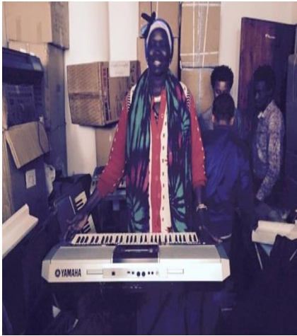
$1,000 for Keyboard

Sudanese Lutheran Mission Society has bought some needed equipment's for worships service as the church developing in worship service not only by using drums but slowly being modify with the use of keyboard. Below is some of the equipment pictures bought for the Gambella congregation by the SLMS.