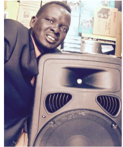
$350 for speaker & mics

As the youth have seen the equipment, they are asking for assistant to train ten of them and the cost for that training for three months is $1,200 . Those Youths are selected from their local Parishes to go and learn the keyboard so that they can go back to teach others. Please, consider supporting our sister church Youth.