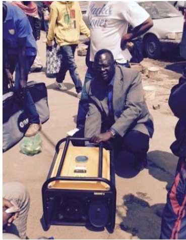
$1,500 for Generator